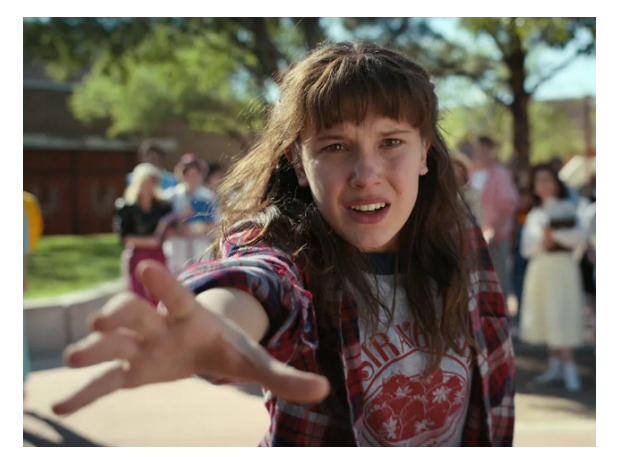
Netflix tentpole Stranger Things